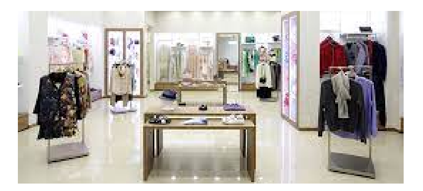
You can still profit from consumer impulse buys while helping to ensure that you are protected from shoplifting attempts.

Anti-Shoplifting detection systems can help your retail store curtail shoplifting without sacrificing open merchandising of high-value, high-theft merchandise.