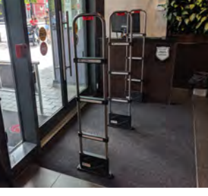
Available Heavy Duty Portable Anti-Theft Panel Floor Stand

For More Info or Pricing on Our Products Please Contact Us