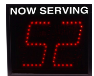
Slave Display 2

Model # TAS/51201-W/TKP-2 Complete Package Kit Special Package