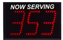
Slave Display 2

Model TAS/51301/W/TKP-2 Complete Package Kit Special Package