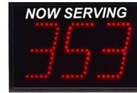
Slave Display 1