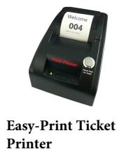
Easy-Print Ticket Printer

(3) 3-Digit 5.5" Display (With audio alert tone when number changes) (1) Large Take a Number Sign (1) Wireless Remote Control (1) Roll of Print Paper (1) Budget Series Take a Number Ticket Printer (1) Comm. Cable