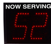
Slave Display 1