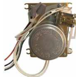
Old Style Cincinnati Clock Mechanical Movement (Discontinued)