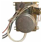
Old Style Cincinnati and Edwards Clock Mechanical Movement (Discontinued)

New Style Solid State Electronic Correctional Clock Movement Kit