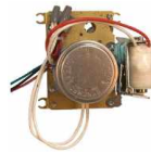
Old Style Simplex Clock Mechanical Movement (Discontinued)