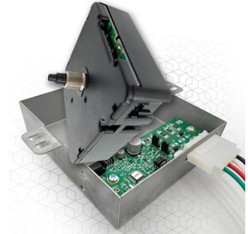
Solid State Reliability

Model TAS-ASKIT01 & TAS-ASKIT02 Movements Kit has everything you need to replace the old style mechanical movement in your Simplex, Cincinnati and Edwards brand clocks! Our easy-to-follow instructions will walk you through each step, Installation instructions