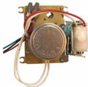
Old Style Simplex / IBM Clock Mechanical Movement (Discontinued)