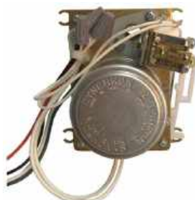
Old Style Edwards Clock Mechanical Movement (Discontinued)