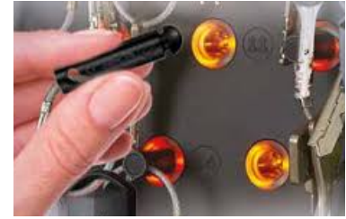
Amber light indicates correct return key position for easy returning of keys back