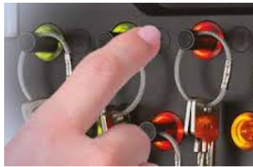
All individual keys and key sets are locked by the traka 21 key system