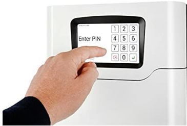
User is required to enter their unique access PIN code to gain access to the key cabinet