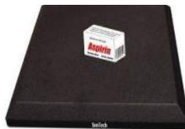
8.2MHz label deactivator

8.2 MHz High Quality Micro Labels 1.25 x 1.25 ( 2000 per roll )