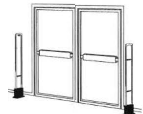
Double Door Application