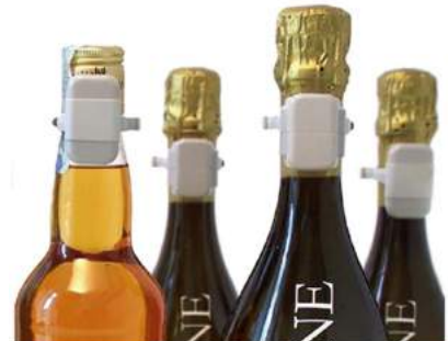
Designer Series Bottle Tags