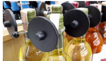
Standard Sereis Bottle Tags