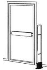
Single Door Application