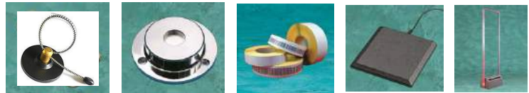
Bottle Tags Tag Detacher Labels Label Deactivator Phazor 8.2 MHz Panels