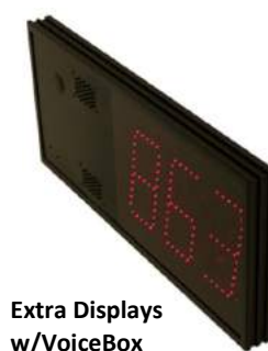
Extra Displays w/VoiceBox