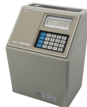
MJR 7000 EZ Optional EZ Version

With The MJR 7000 You'll Never Total Another Time Card Again!