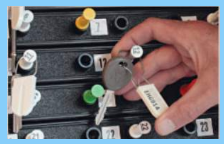
The keys are attached to the system by an anti-tamper security key holder