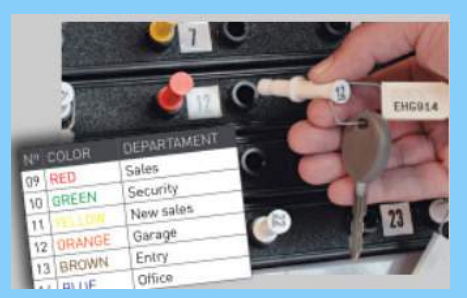
The colored access peg retained on the board will identify the user who has not returned the key