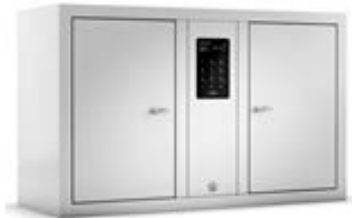
7002 S series Locker Series with 2 storage compartments. Internal dimensions: 2 compartment: 260x400x255 mm