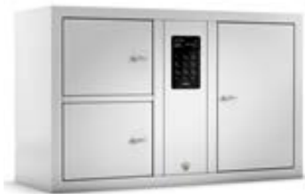
7003 S series Locker Series with 3 storage compartments. Internal dimensions: 1 compartment: 260x400x255 mm 2 compartment: 260x200x255 mm