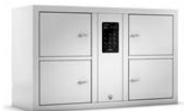
7004 S series Locker Series with 4 storage compartments. Internal dimensions: 4 compartment: 260x200x255 mm