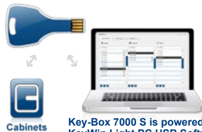
Cabinets Key-Box 7000 S is powered by KeyWin Light PC USB Software

Available Power Charging Option for Cell Phones, I Pads, Radios & Other Electronic Devices for Charging While Being stored