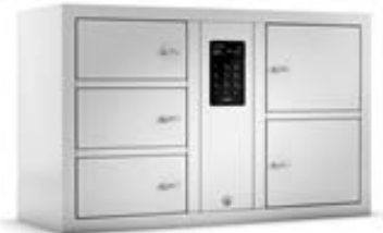
7005 S series Locker Series with 5 storage compartments. Internal dimensions: 2 compartment: 260x200x255 mm 3 compartment: 260x125x255 mm