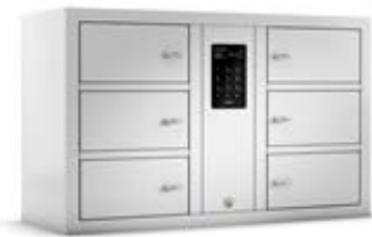
7006 S series Locker Series with 6 storage compartments. Internal dimensions: 6 compartment: 260x125x255 mm