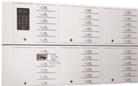
9006 E Expansion cabinet with six compartments