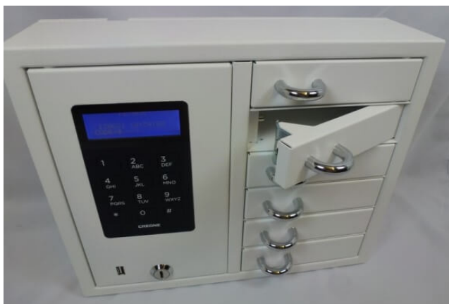
9006 S Series

For Storing/Securing all Businesses/Organizations Facility/Asset Keys