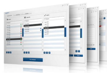
KeyWin 5 Pro Software

Key-Box Key Management Systems are the affordable intelligent choice!