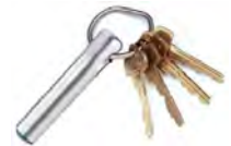
Non-Locking Key Fob