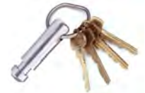
Locking Key Key Fob

Choosing the right key system for your key management requirements Key-Box offers two styles of key systems. The First version is the budget series with Non-Locking individual key fobs and The Second version is our most popular sought after high security series with secured intelligent individual Locking key fobs.