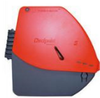
SG-0703 3 Digit Ticket Dispenser