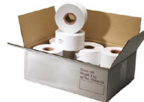
Ticket printer ticket paper rolls..2 roll pack