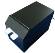
Tickets print with Date and Time