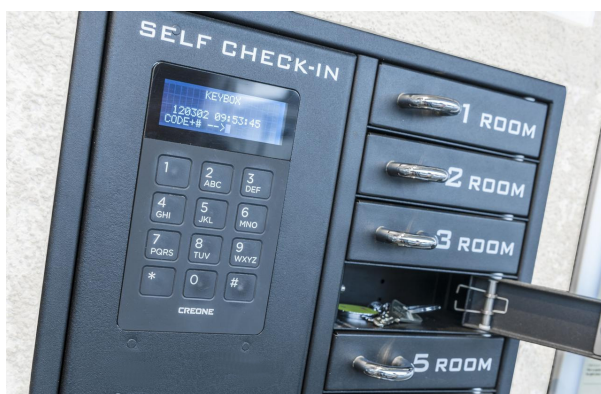
9006 S Series Stainless Steel Cabinet

The 9006 S series is also available in stainless steel cabinet for outdoor use