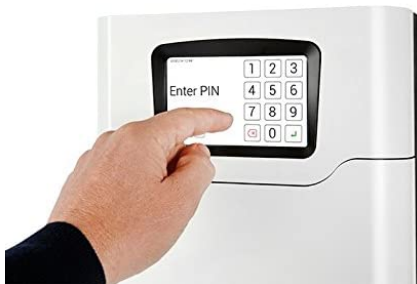
User is required to enter their unique access PIN code to gain access to the key cabinet