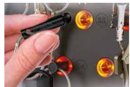
Amber light indicates correct return key position for easy returning of keys back