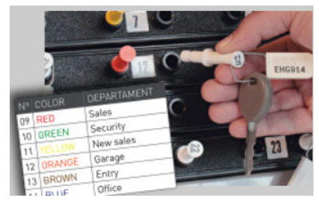
The user access peg retained on the board will identify the user who has not returned the key