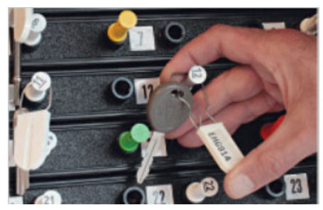
The keys are attached to the system by an anti-tamper security key holder