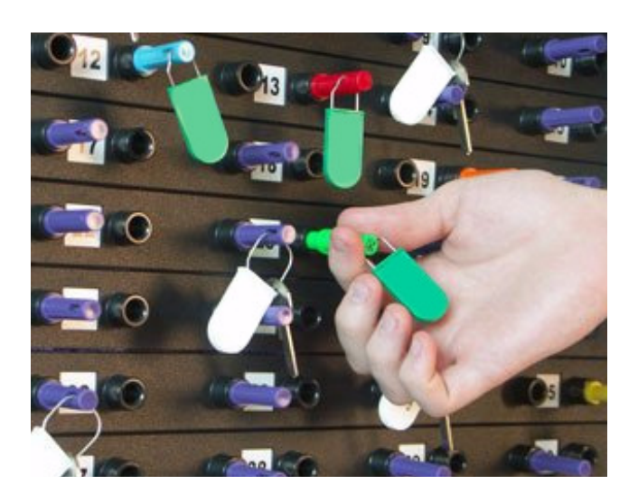
9500 S Secure-Lock

The Key-Box KeyWin Light software provides a full audit trail and activity reporting, detailing who has accessed the cabinet and when. As a result, staff become more accountable and our customers have found that keys are returned at the end of shifts. This leads to reduce security requirements, with less loss, damage and liability