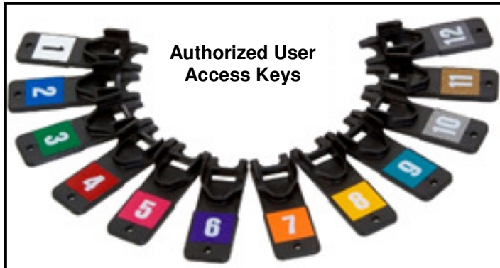
Authorized User Access Keys