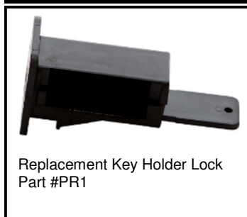
Replacement Key Holder Lock Part #PR1