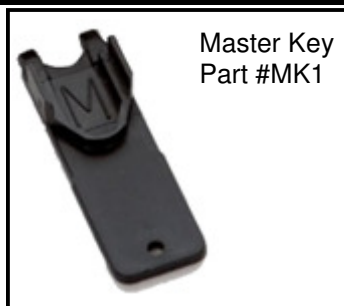
Master Key Part #MK1