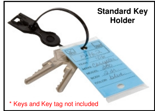
Standard Key Holder