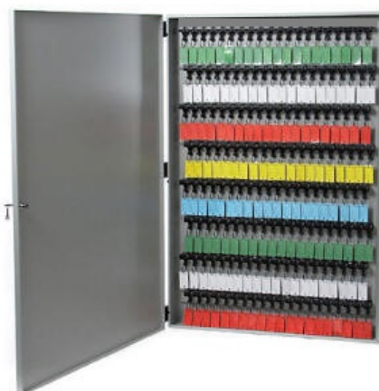
Model: C 160 160 Key System

Our Secure-Lock alternative mechanical key management systems are suitable for managing keys in all sorts of facilities such as housing complexes, condo facilities, hotels/resorts, commercial properties, law enforcement facilities, fleet management, automotive car dealerships, warehousing, airport facilities, etc.