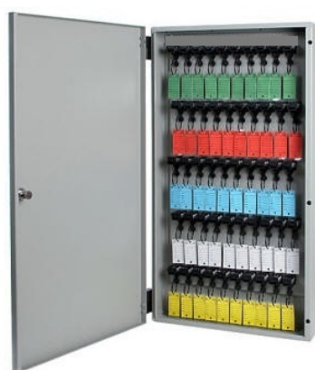
Model: C 50 50 Key System