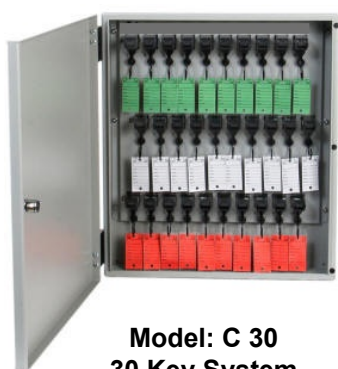
Model: C 30 30 Key System