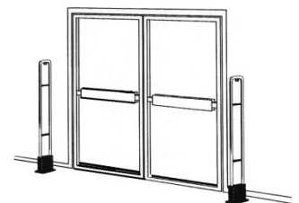
8.2MHz Double Door System