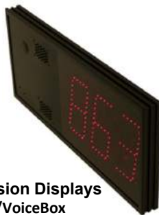
Expansion Displays w/VoiceBox