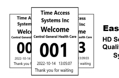
Easy-Print HD Series High Quality Printer Systems

The Easy-Print Professional series electronic ticketing printing system will automatically print ticket number, time and date on the ticket with the push of a button allowing your customers to feel more confident that they will be served more accordingly. The Easy-Print printer can be purchased with any of our take a number quality queuing displays as a standalone or as a complete packaged system.